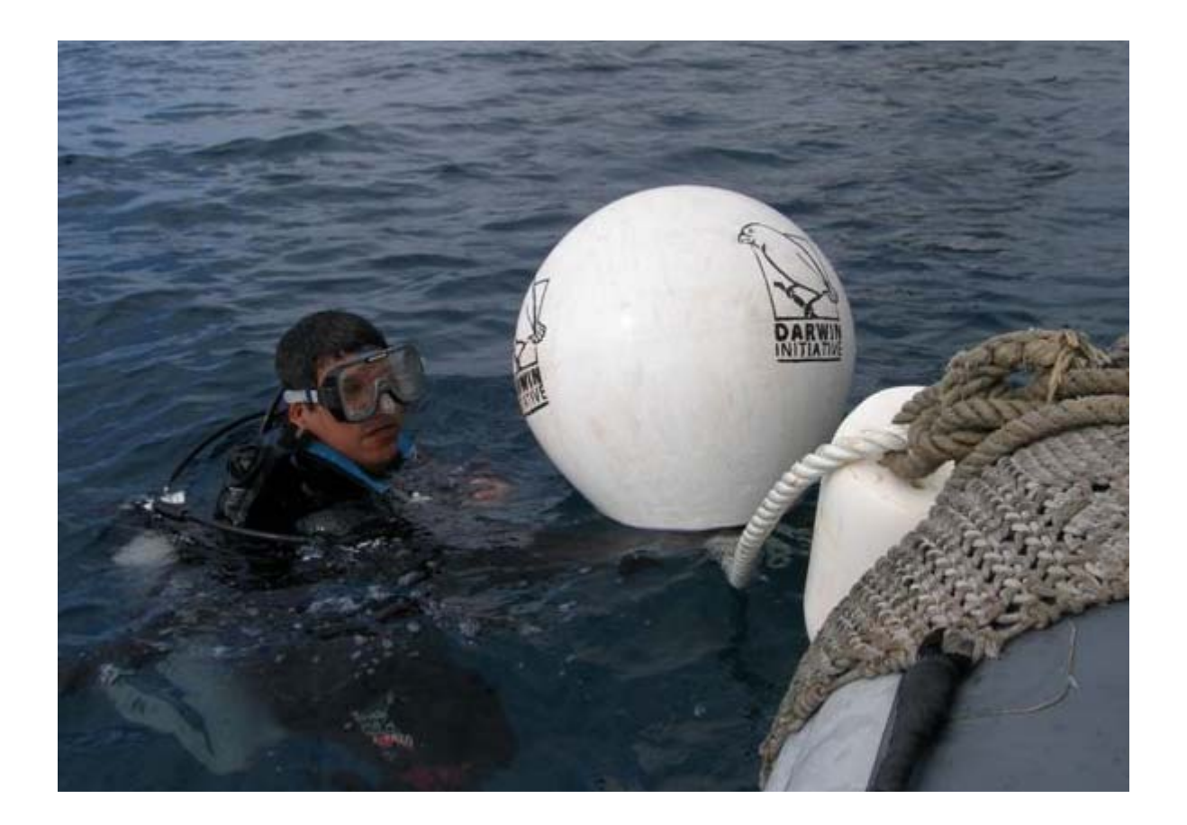
Figure 4. Installation and deployment of a mooring buoy at Bartolomé island, Galapagos.