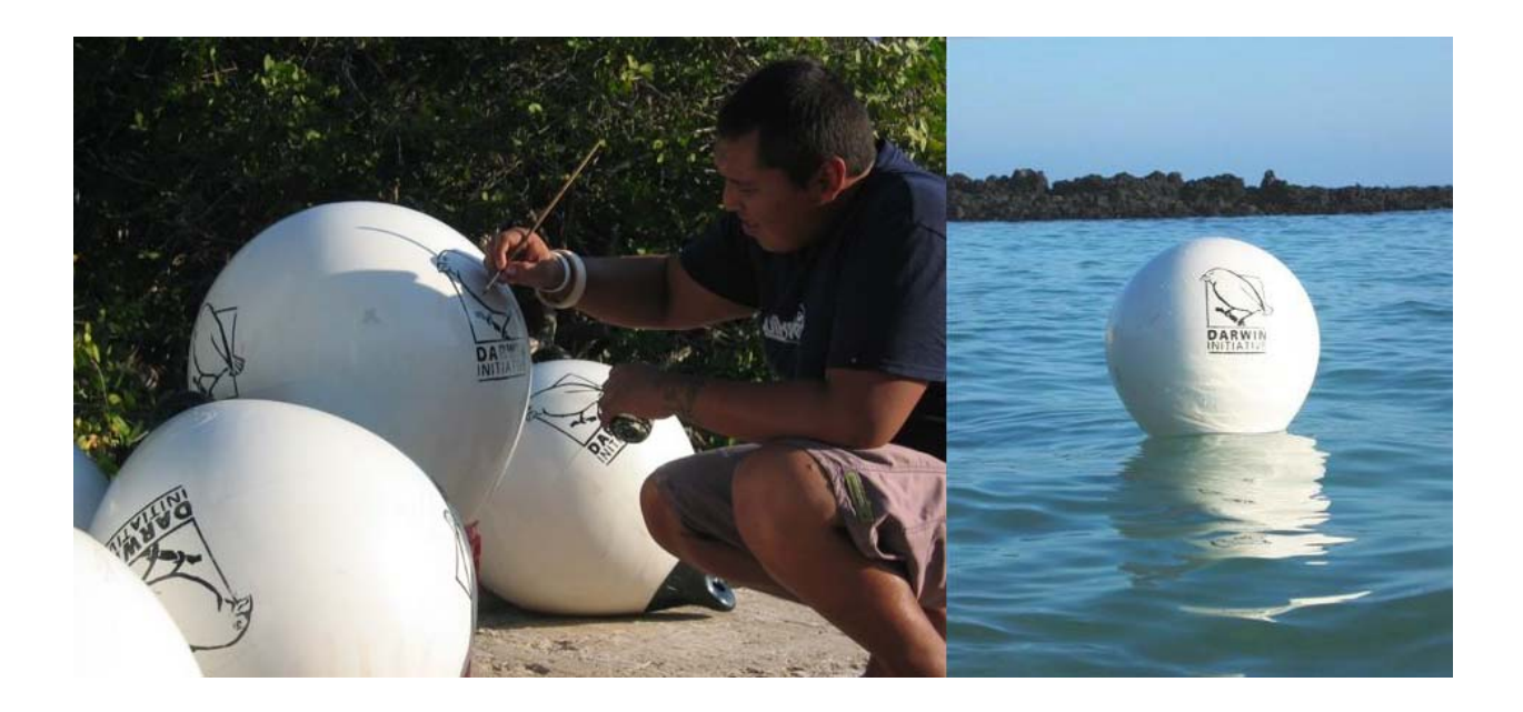
Figure 3. Painting the Darwin Initiative logo on the mooring buoys and a test deployment in Puerto Ayora, Galapagos.

scheduled for installation in late September 2008 by the National Park (not a project output), CI WildAid and CDF encountered various technical and logistical challenges in the installation of buoys which called for considerable coordination between Navy groups and the Park Service led by DI project technicians. After extensive negotiations a test mooring was installed locally in Puerto Ayora and monitored continuously for a month (Figure 3), which was followed by further buoy deployments at Bartolomé island (Figure 4). The output indicators were appropriate for their purpose and are reported against in annex 1.